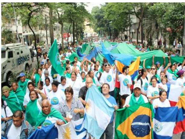
Figure 21: National recycler movements organize for march in Brazil.

ADS 205 Domain: Laws, policies, regulations and institutional practices