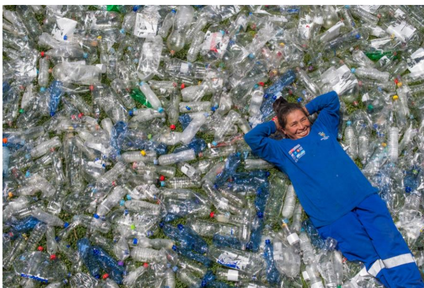
Figure 19:

Women are most visible in the WMR sector as waste-pickers. Many of these women choose waste-picking as the best option available for combining their childcare and household responsibilities with earning an income. Though data is lacking, anecdotal evidence indicates that women are paid less as waste-pickers than their male counterparts because of their restricted access to recyclables in terms of both quality and quantity. Also, female waste-pickers have less access to equipment and vehicles that