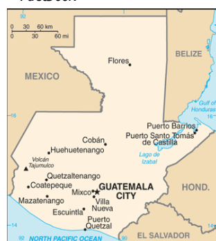
Figure 13: Map of Guatemala.

Women in Guatemala represent 51.2 percent of the total population of 15.8 million. 63 Despite progress on democratic governance, poverty and inequality remain high in rural areas (70 percent poverty rate) and among indigenous groups (56 percent poverty rate). Moreover, when compared to countries with similar per capita income, Guatemala is among the countries with the highest poverty index in Latin America and the Caribbean: 53.7 percent poverty and 13.3 percent extreme poverty. 64 Guatemala has a very diverse population, including 24 linguistic groups and 4 ethnic groups: Maya, Garifuna, Xinka and Mestizo or Ladino and has a history of discrimination and social exclusion of indigenous populations in general, and women in particular. 65 The full involvement of women in economic development is being limited by interconnected territorial, ethnic and gender-related inequalities.