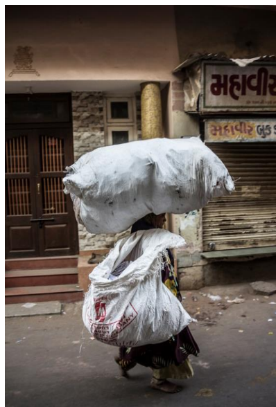
Figure 3: A woman collecting waste in the historic town of Ahmedabad in Gujarat, India.

ADS 205 Domain: Cultural norms and beliefs