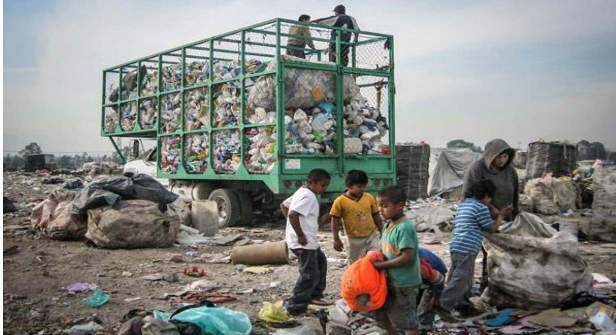
Figure 8: Woman and children waste-pickers at a landfill in Mexico.

Recent developments, however, are creating opportunities for USAID to actively engage with local governments in improving WE3 in the WMR sector. Overall, awareness is increasing among municipalities about the value of waste and the potential revenue that can be generated from recycling as well as the economic importance of WMR in maintaining tourism and generating employment for a burgeoning population. In terms of WE3 specifically, the capacity and reach of women's organizations focused on improving the conditions and identifying the contribution of women working in WMR, both formally and informally, is gaining global attention and momentum. These and other key findings from the literature review are highlighted below. At the end of each finding, the specific ADS 205 domain related to the finding is given. In cases where multiple ADS 205 domains are related to the global finding, only the most relevant ADS 205 domain is shown.