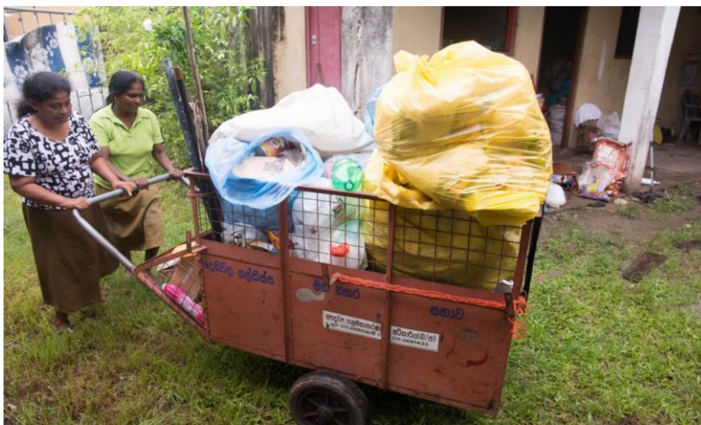
Figure 10: USAID MWRP grantees in Sri Lanka sort and then cart away waste.

It is not enough to engage women at the point of project implementation; they must have a voice at the table in project planning and design to ensure that activities appropriately meet their specific needs and constraints. For example, many WMR interventions focus on the formalization of informal waste-pickers and recyclers – a significant contingent of whom are women. However, many of the waste experts interviewed noted that informal female waste collectors oftentimes