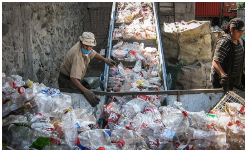
Figure 11: Men and women sort plastics at a private materials recycling facility in Mexico.

In addition to the issues affecting women working in the WMR sector globally, there are several issues specific to the five LAC-focus countries. In general, when compared to other regions, WMR in LAC is notably incipient. Municipal governments require significant assistance and budgetary allocations to develop WMR systems and improve governance. Poor financial management, weak capacity and government coordination and a lack of financial and human resources are commonplace throughout the