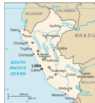
Figure 16: Map of Peru.

Peru has a diverse population of about 31 million, including an estimated 51 indigenous groups. 102 Peru is the only South American country included among the five LAC-focus countries in this analysis. Compared to the other four focus countries, Peru has the highest rate of homicides (78 per 100,000 inhabitants) and highest percentage of individuals that feel unsafe in their neighborhoods. Peru also has the lowest level of respondents that trust their local government and a relatively high level of reported police corruption. These results combined indicate a high level of gang violence as well as government corruption, especially at the local level. Peru is characterized by a very high level of domestic physical and sexual violence against women. It is estimated that violence against women cost the national economy 7.3 billion USD, or close to 7.5 percent of GDP. 103 In order to reduce sexual harassment and abuse of power in the workplace, the Ministry for Women and Vulnerable Populations (MMPV) introduced the El Sello Empresa Segura, libre de violencia y discriminación hacia la mujer (the Secure Company Seal, free of violence and discrimination against women) (see Box 5).