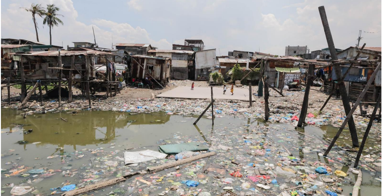
Figure 2: If the world continues on its current trajectory by 2050 there may be more plastic in the ocean than fish.

contributions of women in the sector, while inhibiting the ability of governments, donors and other stakeholders to track and benchmark change.