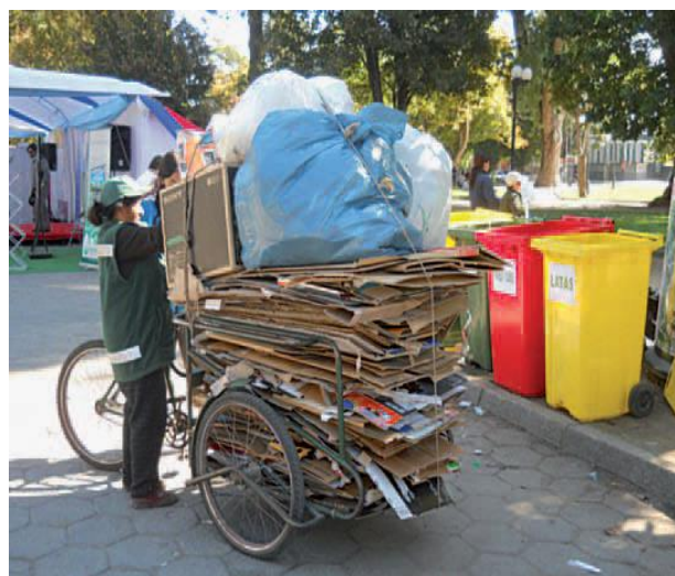
Figure 20: A municipal waste worker in LAC collects recyclables from public receptacles.

In order to meet their waste management and recycling goals, USAID missions in the LAC region need to address the existing bias perpetuated in the male-dominated WMR sector. Homogenous male-only groups may feel more effective and collaborative, but recent research shows that even though working in gender-diverse teams may take more effort, they tend to lead to more effective performance. 149 In fact, working on diverse teams produces better outcomes precisely because it's harder. 150 By fully engaging women in non-traditional jobs in the WMR sector and increasing their participation in decision-making and leadership positions, LAC countries can expand the diversity of their talent pool to tackle current and future WMR sector issues and meet USAID mandates and WE3 priorities.