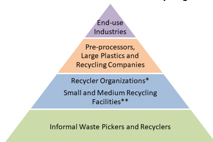
Figure 7: Location of Stakeholders in the Recycling Value Chain

*These include formal and informal recycler cooperatives, associations, networks and movements.