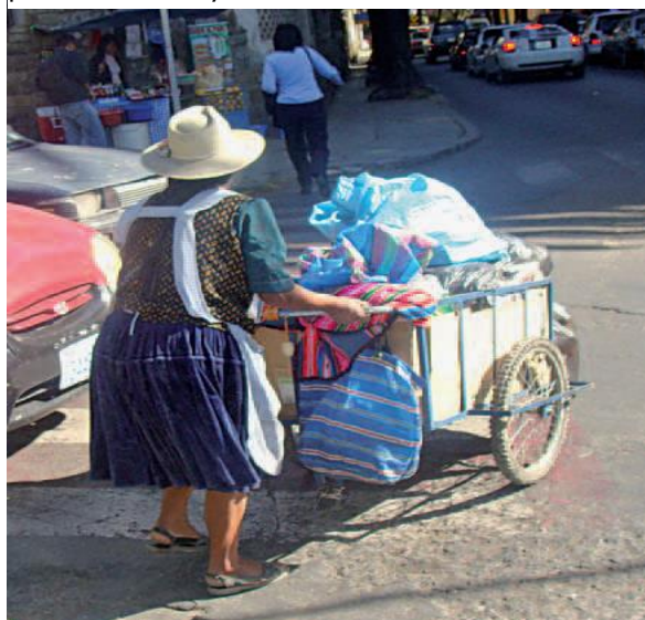
Figure 4: A woman recycler in LAC navigating traffic with a pushcart full of recyclables.

ADS 205 Domain: Laws, policies, regulations and institutional practices