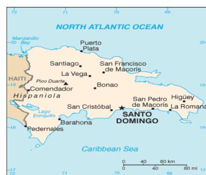
Figure 15: Map of the Dominican Republic.

The estimated population in 2016 was 10.7 million 86 with close to a 50/50 split of women and men. 87 Although the Dominican Republic has one of the fastest growing economies in the region, more than one-third of its population lives in poverty and almost 12 percent live in extreme poverty. Almost 70 percent of the population lives in urban areas. 88 As an island nation, the Dominican Republic tends to experience higher transportation costs than the other four focus countries in LAC, which can directly affect the costs associated with recycling activities.