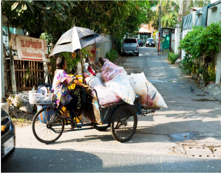
Figure 9: Elderly woman in Bangkok collects recyclables from residential neighborhood.

2. A traditional gendered division of labor exists throughout the WMR sector globally. Women are represented in greatest numbers at the base of the recycling value chain, most often as informal waste-pickers and recyclers , with limited upward mobility. They are predominantly responsible for work that is household-based and/or work that is perceived to require more focus, discipline and coordination, such as sorting, administrative work and communications. Men are predominantly responsible for work that includes heavy lifting; the use of equipment, motor vehicles and