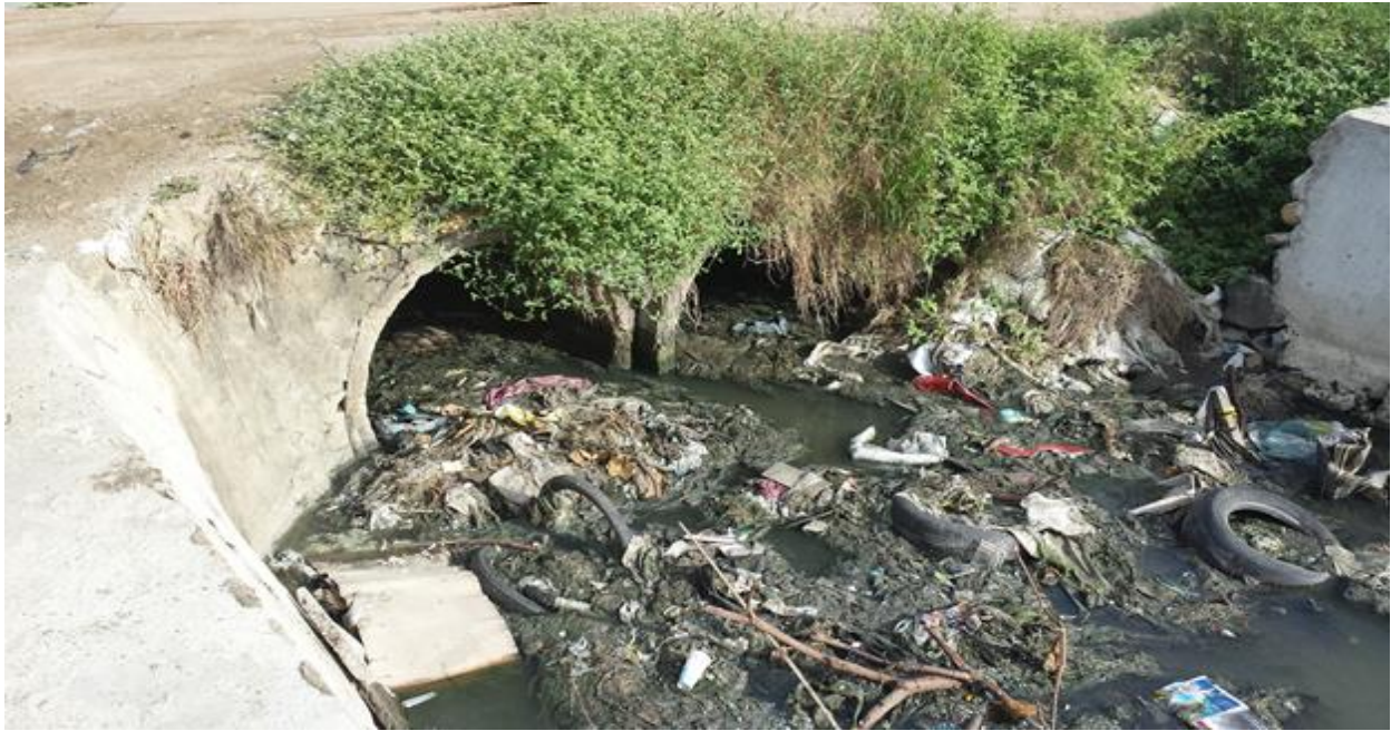
Figure 5: Open dumping in the Philippines – a country comprised of thousands of islands – leads to garbage buildup in canals and waterways that flows out to the ocean untreated.

organizations globally and in LAC are working at the specific intersection of WE3 and WMR. The desk review and KIIs revealed that limited expertise and understanding exists around the gender dimensions of waste among leading development organizations working in WMR. Section 4.3 features the few organizations identified that work in this domain and highlights related donor initiatives that could strategically support WE3 in WMR.