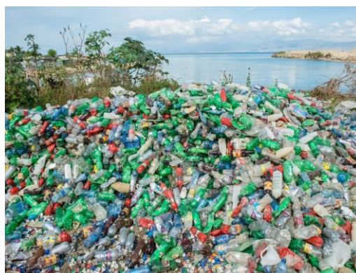
Figure 18: Plastic waste on a beach in Haiti, where Dell launched its ocean-bound plastic pilot project. Dell, which claims to be world's largest technology recycler, became the first company to use ocean-bound plastic in its products in a venture that started in 2016 in partnership with ocean life charity Lonely Whale Foundation.

Finally, with regard to potential country and regional partners in LAC, while this study did not allow for fieldwork or comprehensive KIIs within each of the five focus countries, the team has compiled a preliminary list of key WMR stakeholders including: LAC regional and national government entities; country-specific NGOs and recycler organizations; regional NGOs, associations and initiatives; and private-sector plastics and recycling companies. This table is available in Annex G.