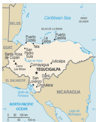
Figure 12: Map of Honduras.

In 2016, Honduras had an estimated population of 8.2 million (51.19 percent women and 54.7 percent urban); 50 31 percent of its population was under 15 years of age and 7.4 percent was 60 years old or older. Honduras is characterized by a high-degree of inequality (Gini coefficient of 0.54 in 2013) with almost 65 percent of households found to live in poverty, 43 percent of them in extreme poverty. 51 Indigenous and Afro-descendant people make up 8.6 percent of its population, with nine indigenous groups present in the country. 52