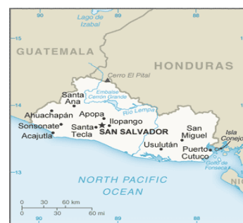
Figure 14: Map of El Salvador.

from 1980-1992, where thousands of people were displaced and over 70,000 people killed-- many of whom were women and children. 76 After the end of the civil war, criminal activity and particularly gang-related violence increased dramatically. In recent years, El Salvador has had one of the highest homicide rates in the world. Extortion and disappearances are also extremely high. Crime and violence have a large negative affect on small businesses due to lower revenues and sales. 77